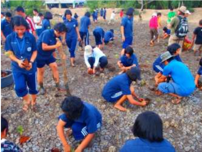
Krabi, Thailand, 2009