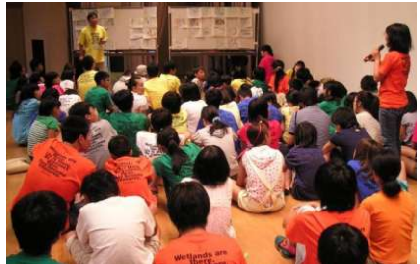
Plenary discussion and accomplishment of output