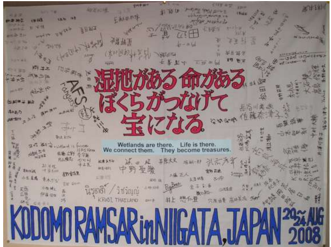
KODOMO Message for Ramsar COP10