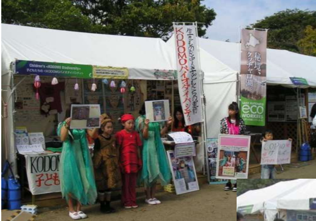
Performance in front of the exhibit booth of “KODOMO Biodiversity” at CBD_COP11, Nagoya, Japan , 2010