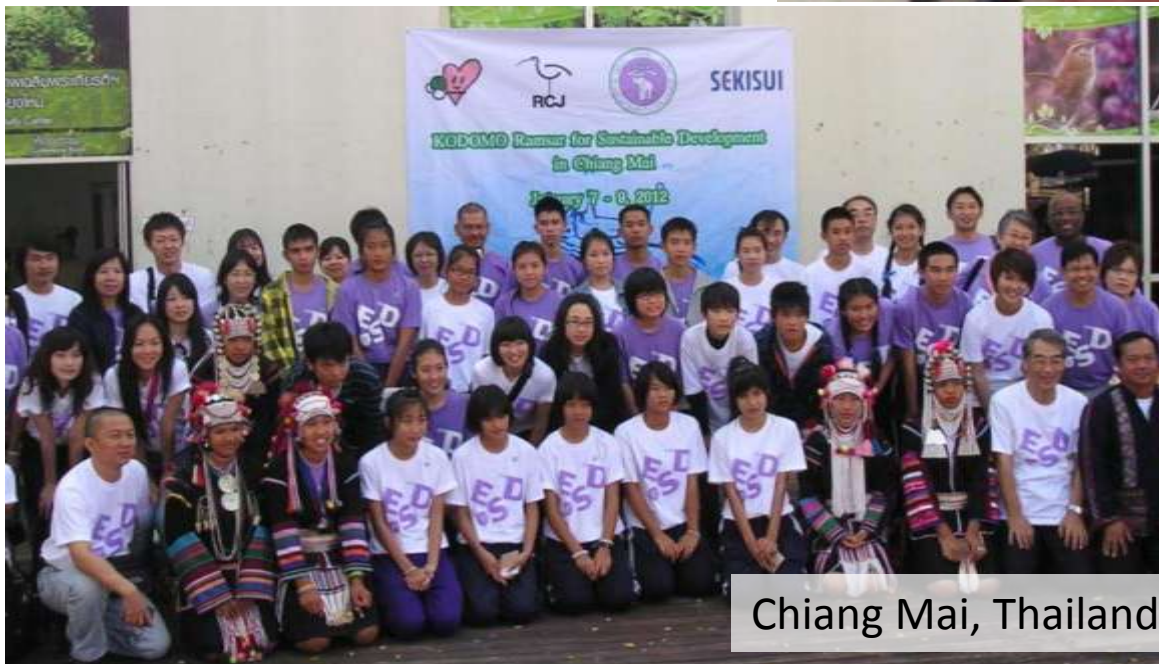
Chiang Mai, Thailand