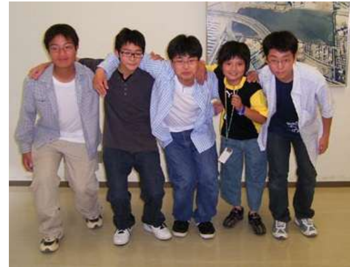
Kick-off meeting on 10 June 2006 at Yatsu-higata Ramsar Site, Narashino, Japan