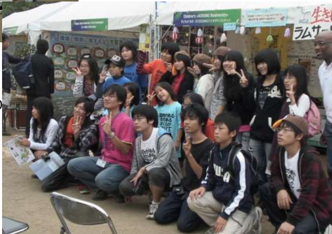
41 children from various Ramsar sites participated in the event as volunteers .