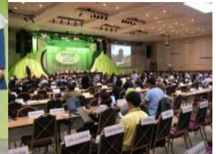
Presentation of the Children's Messages at the Opening of the Ramsar COP10